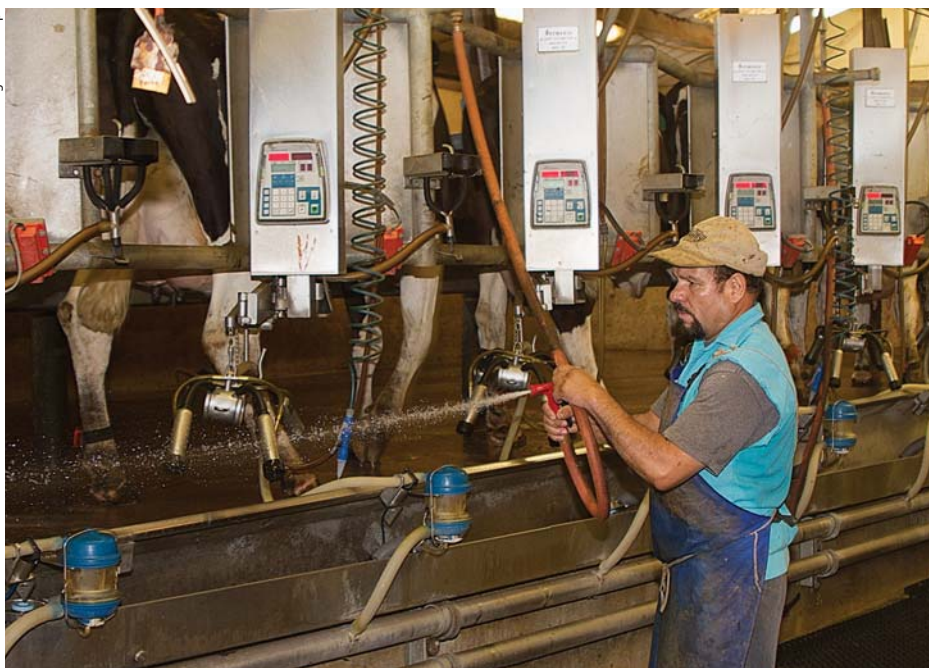
In a recent survey of San Joaquin Valley dairy workers, the reasons most often cited for leaving employment were compensation and benefits, economic problems at the dairy, and personal and family matters.