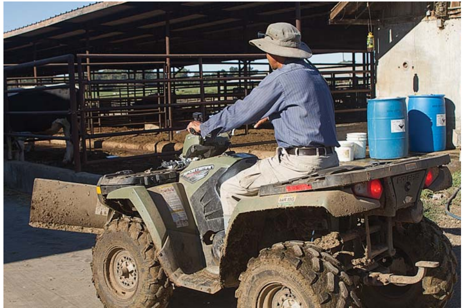
The average length of dairy employment was 6.6 years; the range was from 2 weeks to 40 years. The average number of jobs among people with previous dairy positions was three.

Using the snapshot approach, the average length of employment at the time of interview was 6.6 years, and the range was from 2 weeks to 40 years. By contrast, when we used the completed-tenure approach, the average length of employment was only 3.5 years. The subset of subjects without previous dairy employment ( n = 92), who would not have been interviewed if we had used only the completed-tenure approach, had an average length of employment of 7.1 years, and the range was from 5 weeks to 40 years. The subset of subjects with previous dairy jobs ( n = 114) had an average length of employment of 6.2 years. On average, these subjects had held three dairy positions, that is, the present job plus two more. As Billikopf noted in 1984, there is great variability